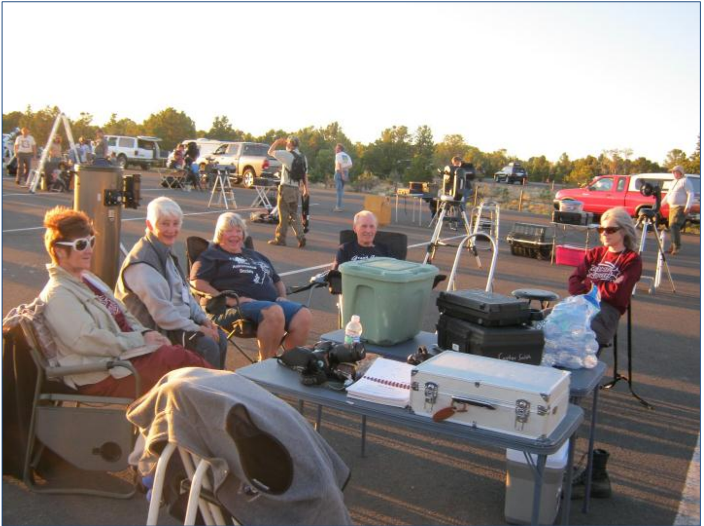
Companionship among amateur astronomers at the Grand Canyon Star Party 2011