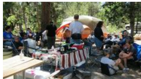
Pizza Party on Day 2