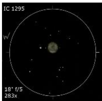
IC 1295 RA: 18h 54.6 min Dec: -8° 50' Constellation: Scutum Brightness: 11m7 Central star: 16m9 Size: 100x90 arcsec Distance: 4200ly

Sometimes, PNs do not only impress the observer by their own appearance but also by their environment. IC 1295 is one of them. Lying in Scutum, this nebula was discovered by the American astronomer Truman Safford in 1919 at the age of 83. With a size of 1'7 \times 1'4 and a magnitude of 11m7, one should be able to see it with a 5" telescope. What makes this PN so special is its proximity to the globular cluster NGC 6712 (8m2). At small magnifications, both objects appear in the same FOV. Try a UHC or OIII-filter, it will attenuate the globular but enhance the PN's contrast. I observed IC 1295 on June 26 th , 2011 with my 18" Dobsonian. My description reads: At 94x, the GC NGC 6712 is in the same FOV (spectacular!), no central star, diffuse, easily visible without any filter, reacts strongly to UHC and [OIII], nice star field, subtle structures, a little brighter to the north and dimmer in the center; 283x, fst 6m4 (Lyr)