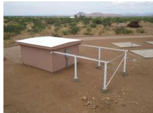
Completed roll-off roof observatory at CAC