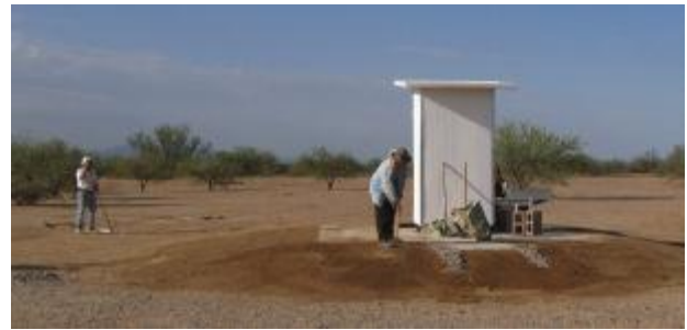
Gila Monster Observatory atop "Mons Heloderma". The Meade 16" Schmidt-Cassegrain is housed in the observatory