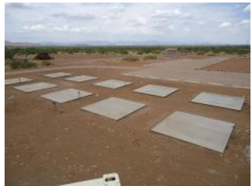
CAC's ten telescope pads with electricity

The August CAC Star Party is scheduled for 8/27. The monsoon season has been very active at the CAC Site recently, so we will have to watch the weather conditions carefully as the star party approaches.